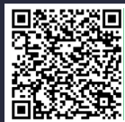
Manulife Stewardship Brochure