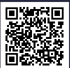
Timberland and Agriculture Sustainability

Check out our Sustainability and Timberland Operations pages: